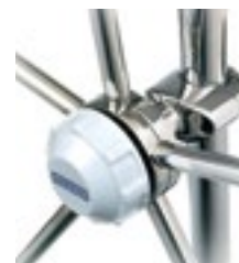
89400327 Rail Mount Wheel Holder