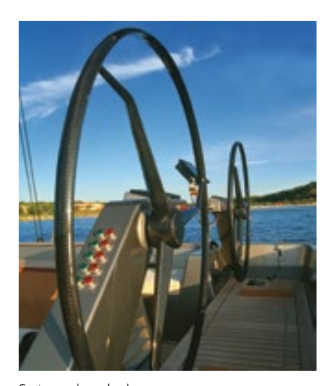
Custom carbon wheels

Lewmar designs custom wheels to fit a pedestal specific to the customer's requirement. 3D modelling is used to ensure that the wheel fits first time, even in tight spaces.