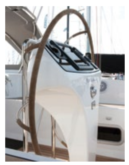
Custom dished wheel designed to mount on the back face of the customer's own pedestal for which they have a registered trademark.