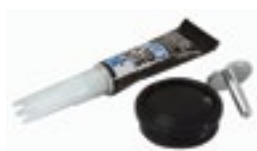
89800013 Rubber button plunger kit