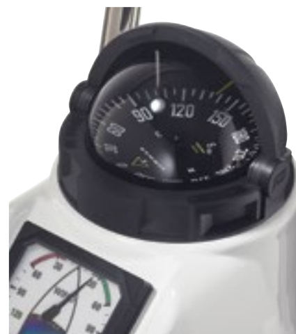
Lewmar 135 Compass flush mounted in pedestal