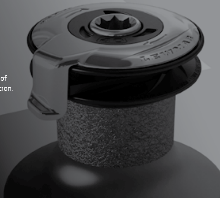
Dimensions Diagram EVO® Self-Tailing Winch