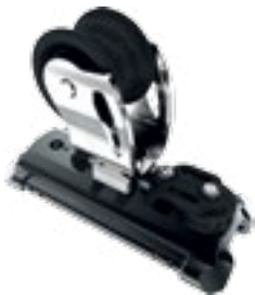
TB Genoa Car with Single Control Line Sheave