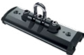
SR Car with Shackle