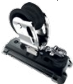
TB Car Genoa stirrup, single CL sheave and becket