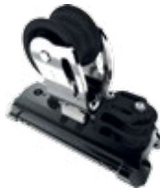
TB Genoa Car with Double Control Line Sheaves