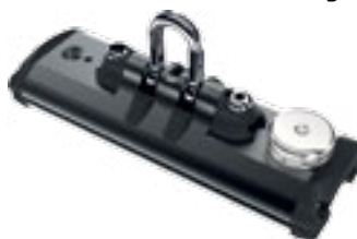
SR Car with Shackle and Plunger Stop