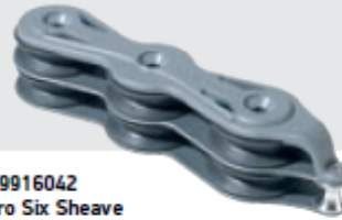
29916042 Synchro Six Sheave Double Stacked