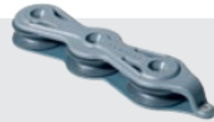
29916060 Synchro Three Sheave Single