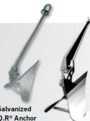
Galvanized C.Q.R.® Anchor

The C.Q.R.® anchor has gained legendary status for its superior performance. The original drop-forged construction of the C.Q.R.® anchor increases its strength and reliability under load – a genuine C.Q.R.® anchor will not break. Its hinged shank delivers consistent setting and holding even in the very worst conditions. The C.Q.R.® anchor is guaranteed for life against breakage 1 and has Lloyd's Register General Approval of an Anchor Design 2 as a High Holding Power anchor.